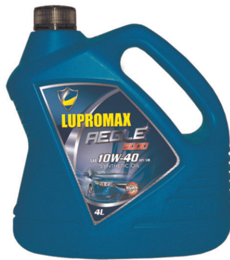
AEGLE 5000 10W-40 Synthetic Oil