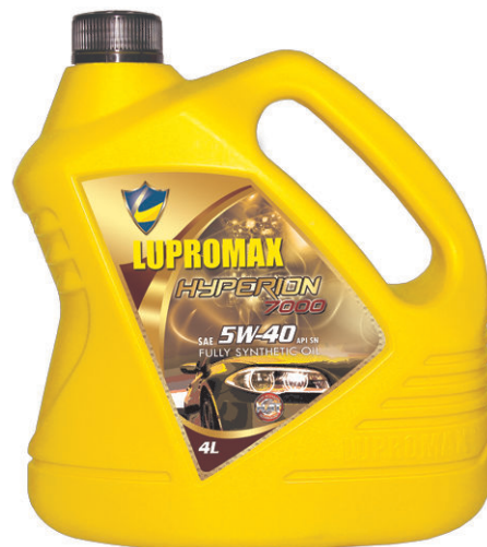
Hyperion 5W-40 Fully Synthetic Oil