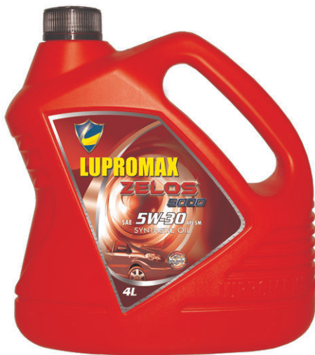
Zelos 5000 5W-30 Synthetic Oil

Revolutionizing the Lubrication Industry through Heat Activated Technology