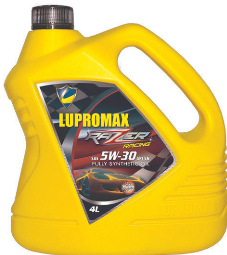
Razer Racing 5W-40 Fully Synthetic Oil